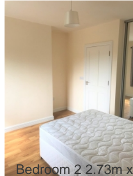
Bedroom 2 2.73m x 2.54m with Oak Flooring