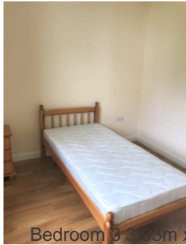
Bedroom 3 3.03m x 2.63m with Oak Flooring