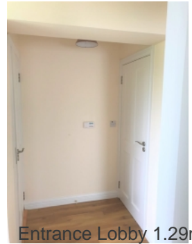
Entrance Lobby 1.29m x 1.16m with Oak Flooring