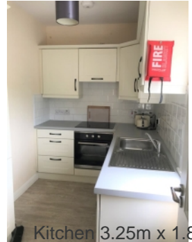
Kitchen 3.25m x 1.86m