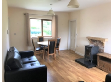
Fireplace with stove